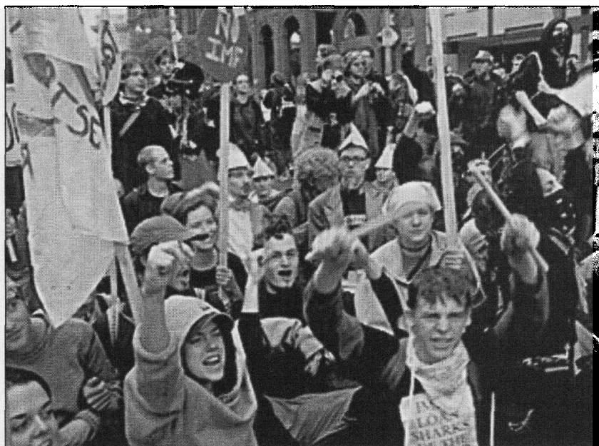
Protesters in Washington, D.C., during April IMF/World Bank meetings.

CEO Phil Knight. The Davos Forum, in fact, placed the question of reform at the top of the agenda of the meetings it held for the global elite.