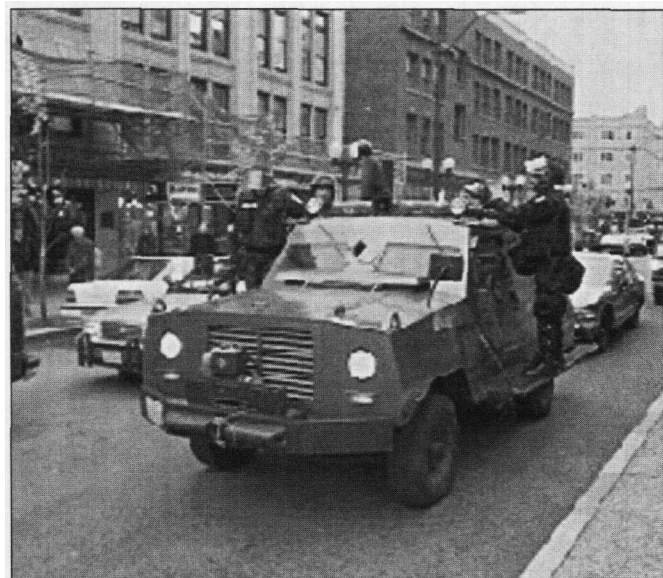
Police prepare to confront WTO protesters in Seattle.

Walden Bello is director of Focus on the Global South, professor at the University of the Philippines and author of numerous books.