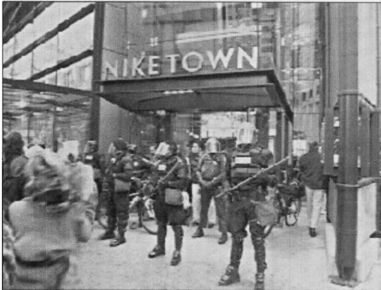
Police guard Niketown during the Seattle WTO protests.

emptive, pre-crisis credit line at the Fund (which no country wants to avail of) and a toothless Financial Stability Forum — where there is little developing country participation — appear to be the only “innovations” to emerge from the Asian, Russian and Brazilian financial crises of the last three years.