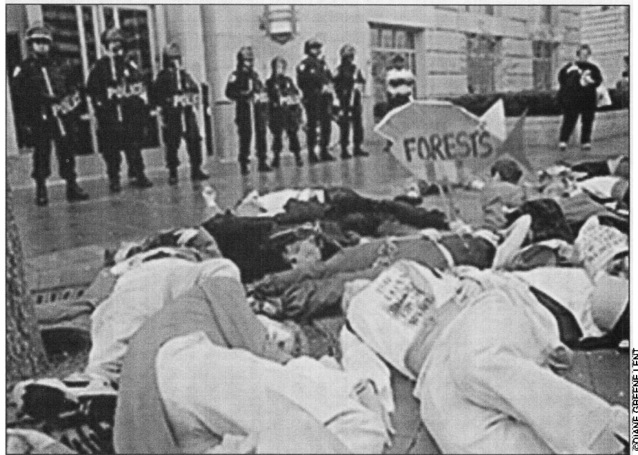
Protesters in Washington, D.C., during April IMF/World Bank meetings.

Assessing the post-Seattle situation, C. Fred Bergsten, a prominent advocate of globalization, told a Trilateral Commission meeting in Tokyo last April that “the anti-globalization forces are now in the ascendancy.” That description is even more accurate now. With the global elite itself having lost confidence in them, a classic crisis of legitimacy has overtaken the key institutions of global economic governance. If legitimacy is not regained, it is only a matter of time before structures collapse, no matter how seemingly solid they are, since legitimacy is the foundation of power structures. The process